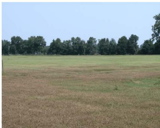
Figure 1. Alicia bermudagrass infected with Helminthosporium in Lowndes County, Georgia. Infected areas appear "bronzed" or red.

Several environmental and biotic factors can reduce yield and quality of forage crops. Diseases are by far