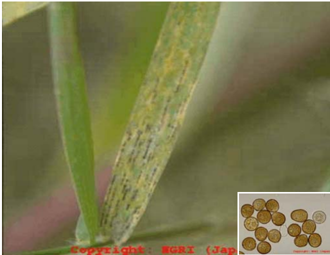
Figure 4. Puccinia or leaf rust on bermudagrass. Inset shows magnified conidiophores of leaf rust.

varieties are highly susceptible. While not a formal variety, common bermudagrass is often infected with leaf spot and is probably the most commonly reported susceptible “variety.” Most reported problems are in under-grazed pastures during late summer. Two improved varieties also appear to be extremely susceptible: Alicia and World Feeder. Note that both of these cultivars were introduced to Georgia from more arid areas of central Texas and Oklahoma. It is not uncommon to observe increased disease susceptibility when varieties originating from arid climates are introduced into more humid areas.