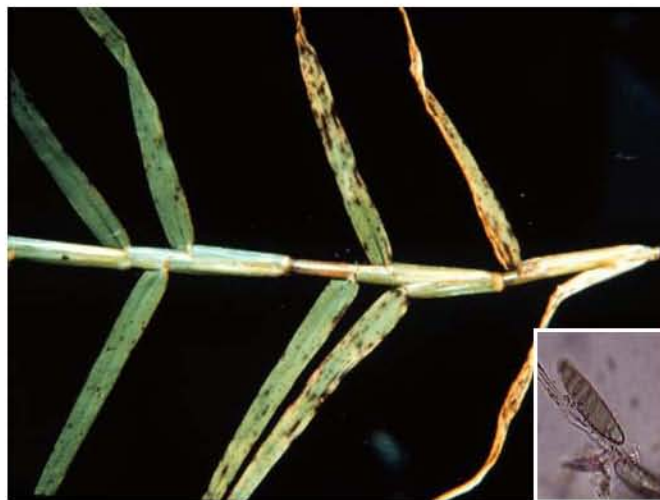
Figure 2. Helminthosporium symptoms on bermudagrass. Inset shows closeup of conidiophores.

the most prevalent adverse factors affecting forages. Bermudagrass leaf spot is a disease that decreases yields, nutritive value and palatability. Bermudagrass leaf spot is caused by a fungus from the genus Helminthosporium and the disease has been informally called Helminthosporium leaf spot, Helminthosporium leaf blotch, or Leaf Blight. Recently, the genus Helminthosporium has been taxonomically reclassified into Cochliobolus (anamorph Bipolaris ) and Pyrenophora (anamorph Dreschlera ). Bipolaris cynodontis has been suggested as the probable causal agent of the disease. For identification and training purposes it continues to be known and informally named as Helminthosporium .