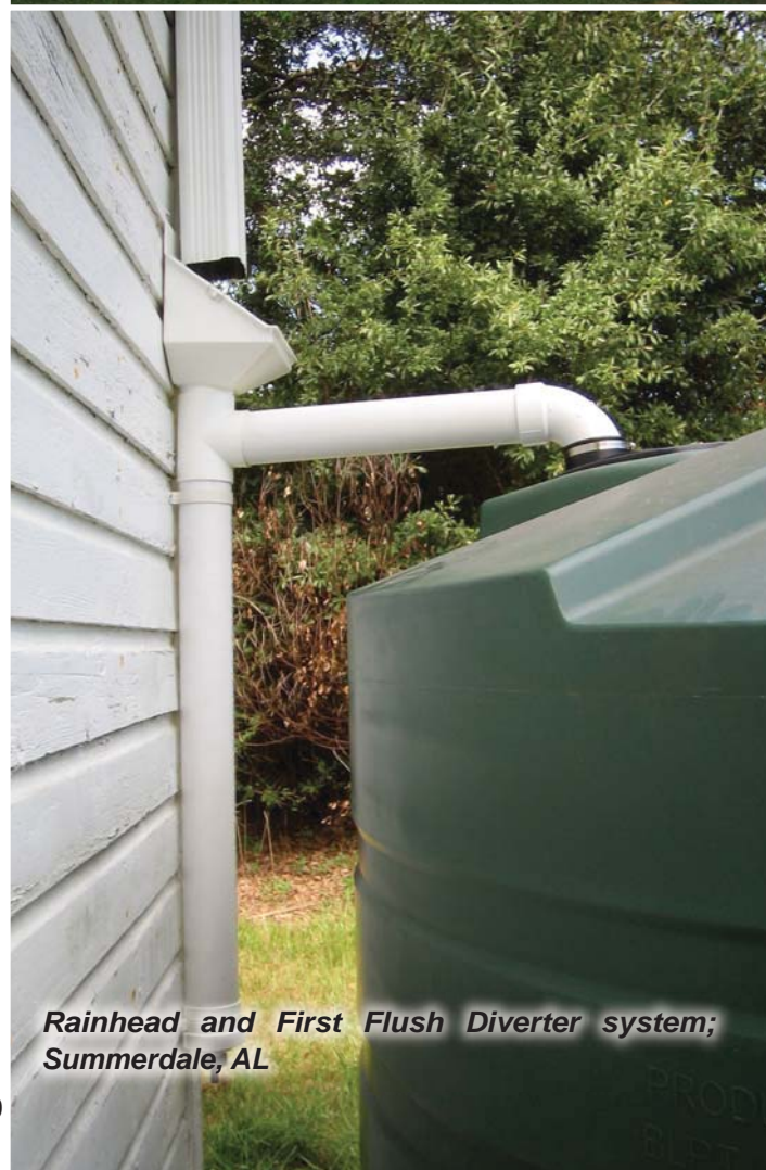
Rainhead and First Flush Diverter system; Summerdale, AL