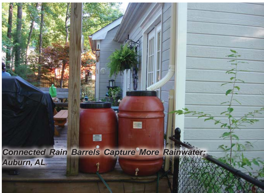
Connected Rain Barrels Capture More Rainwater; Auburn, AL

More information about rain barrels can be found on the Alabama Rain Barrel Project page at www.alabamarainbarrelproject.com .