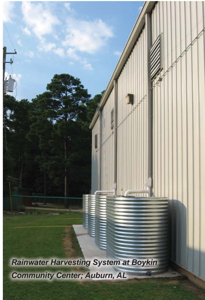
Rainwater Harvesting System at Boykin Community Center; Auburn, AL

Call 811 to locate utilities before you begin any type of excavation ( www.al1call.com )