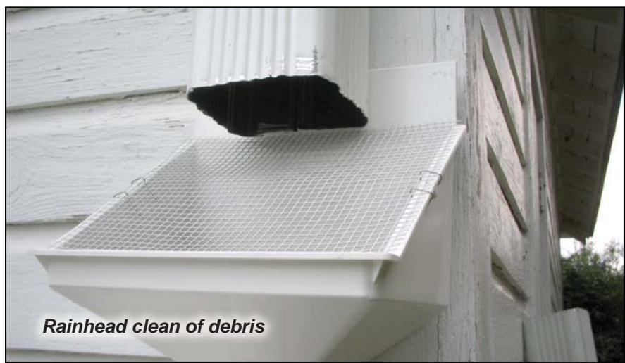
Rainhead clean of debris