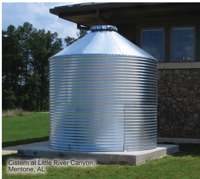
Cistern at Little River Canyon; Mentone, AL

Synonyms: Rooftop runoff management, stormwater collection system