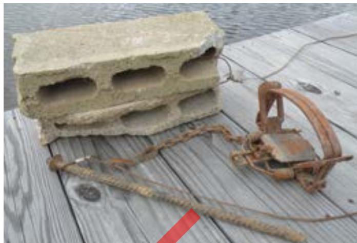
A drown slide setup using a #5 coil spring foothold trap.

When the dam is finally ready to be cleared, several options exist. The final decision depends on the goals of the landowner, size of the dam, and economics. If the dam is small, potato rakes and axes may be sufficient for tearing out a hole to allow water to drain. Larger dams may require the use of heavy equipment or explosives to move the large volume of sticks, mud, and other debris from the dam. Explosives can be dangerous and are subject to state and federal regulations. If a dam requires explosives, contact the United States Department of Agriculture, Wildlife Services for more information.