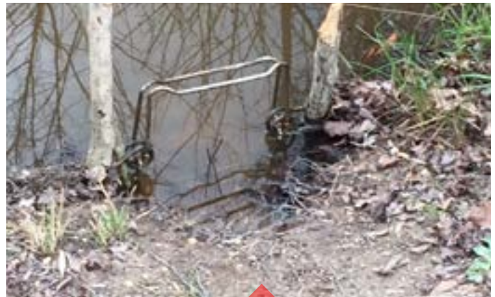
A body gripping trap set where a beaver slide meets the water's edge.

Another productive set is body grip traps placed in shallow runways between bank dens, lodges, and feeding areas. If beaver are active, these runs are usually visible and easy to locate. Many times, beavers may be trapped close to the water's surface. In such cases, the trap should be positioned with the top of the trap 2 to 3 inches above the surface, the trigger mechanism beneath the water, and the prongs sticking upward. In some instances, it may be necessary to modify trap positions for deeper sets. Make dive sets by placing a stick across the surface of the water above the trap. This forces the beaver to dive under the stick and through the trap. Scent mound sets using beaver castor as a scent lure can be used at sites where beavers may have been crawling out of the water.