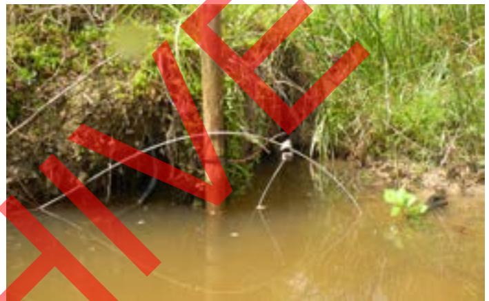
A snare set at the entrance of a bank den.