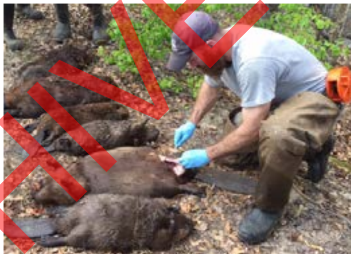
Adult and juvenile beaver caught from one pond in a single night's trapping. Castor gland is being removed to use in making a lure for future trapping.