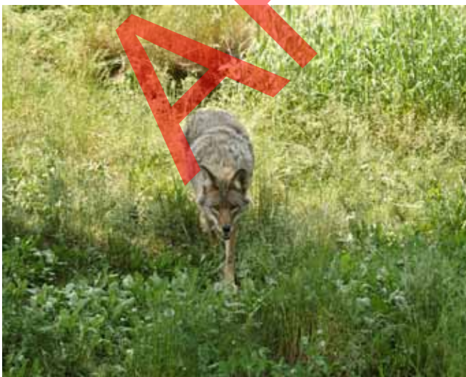
Coyote on the prowl.

Control of predators by intense and sustained removal of coyotes has been shown to increase the average litter size per female, as resources become more abundant when the population of adults is decreased. Removal of coyotes via trapping and shooting can reduce local populations, but it must be performed on a continual basis to reap benefits. Coyotes are extremely wary, but they can be trapped. Leghold traps (Nos. 2, 3, and 4) seem to work best. Snare sets, where legal, can also be used with some success. Strategies