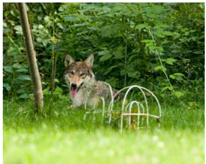
This coyote is comfortable in a residential backyard.