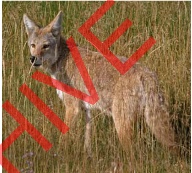
The coyote ( Canis latrans ) has become a familiar critter in Alabama.

Coyote tracks are similar to those of domestic dogs, with the front and rear paws registering four toes and a central paw pad. Unlike the tracks of cats (pumas, bobcats, or domestic cats), which show central paw pads with two lobes toward the front and three toward the back, coyote tracks (and those of other canines) show only one lobe in front and two lobes in back. In coyote tracks, an X can be drawn in the space between the toe pads and the central pad. Claw marks are