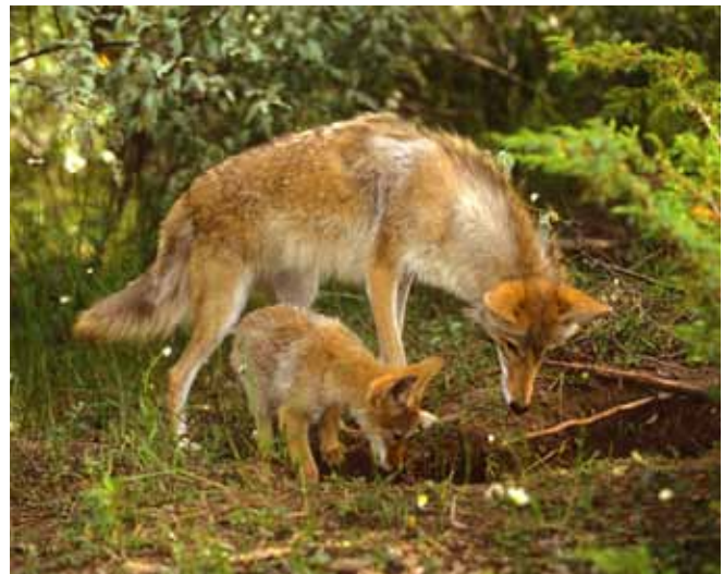
In Alabama, pups are usually born in April.

A coyote's home range varies based on the availability of prey, habitat, season, and whether the coyote is male or female, part of a pack or solitary, and many other factors. Territories may be as large as 10 square miles or as small as 1.5 square miles. Nomadic coyotes may even have home ranges of more than 35 square miles. Populations appear to occur at higher densities in the southern states as opposed to northern states, and densities may vary from fewer than 1 coyote to more than 15 per square mile, depending on the habitat. A few wild coyotes have lived to be 12 years or older, but most of the population is less than 3 years old.