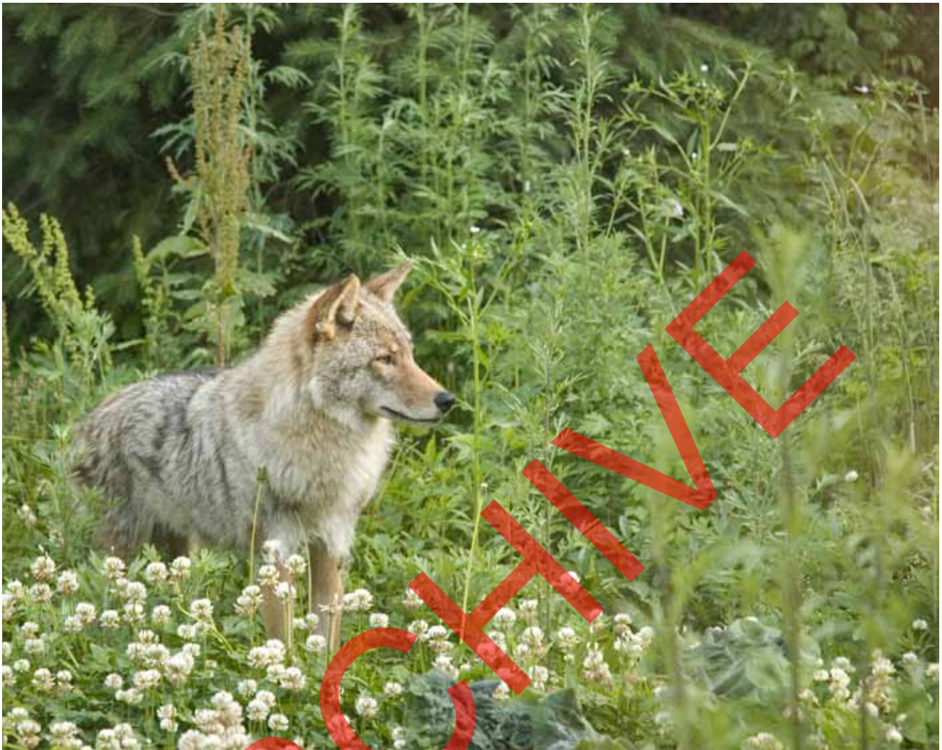
Coyotes can be enjoyable to watch from a safe distance.

used to manage damage to livestock can also be used to reduce damage to melons and other crops. For more information about controlling coyotes, see Extension publication ANR-0587, "Coyote Control in Alabama."