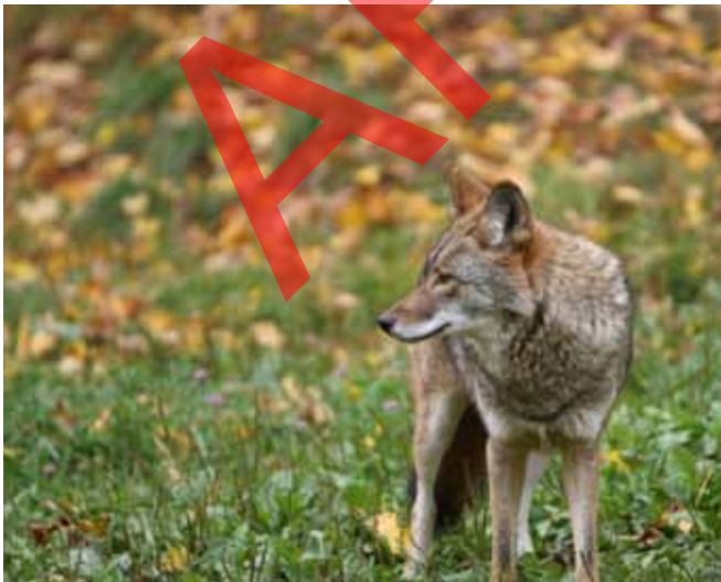
Coyotes usually are tan or grayish, with black and white highlights.

About 60 to 63 days after mating, usually sometime in April, the female will give birth to 2 to 12 pups. The average litter size in Alabama is 2 to 6 pups. Coyote pups are born with their eyes closed and begin to open them by about 2 weeks of age. Pups consume only milk during the first weeks of life but are soon introduced to meat. Both parents stay in or near the den while the pups are small.