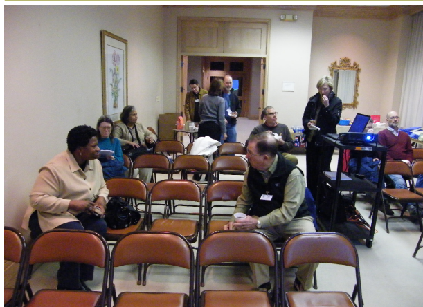
Eighteen JCMGA members attended the first-ever night meeting on February 24th.