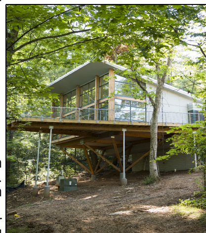
Ruffner Mountain GREEN Visitor Center