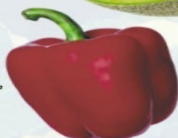
Red Bell Pepper