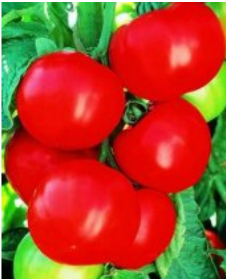
First Lady II Tomato