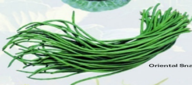
Oriental Snap Beans