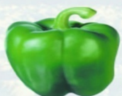
Green Bell Pepper